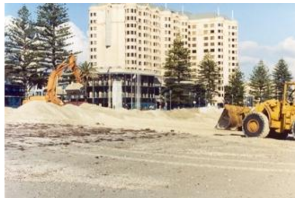
Image 10 Sand carting at Glenelg Beach