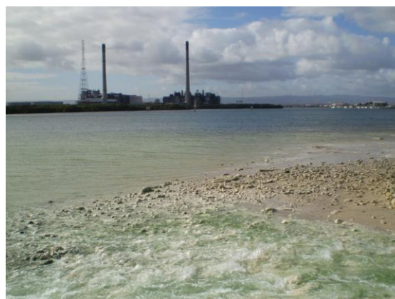
Image 8 Penrice Soda Holdings works (left) and discharges to Port River (right)