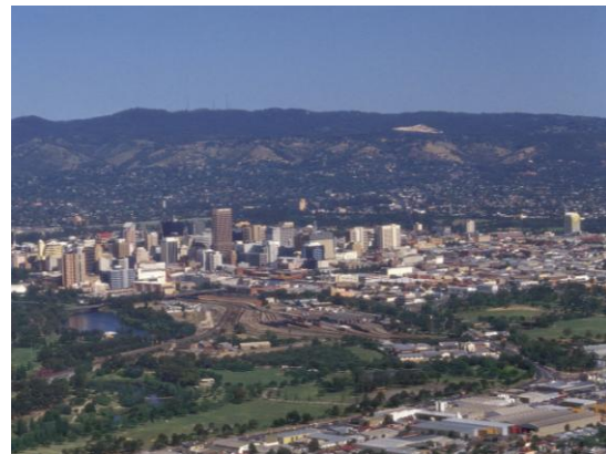
Image 5 Adelaide 2009