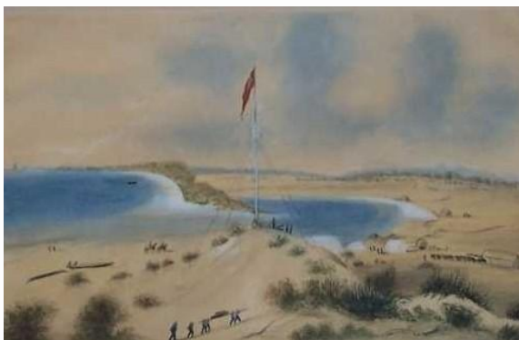
Image 1 Glenelg foreshore 1837

When Adelaide was selected by Colonel William Light for South Australia's state capital in 1836 there was a wide belt of coastal dunes and wide sandy beaches stretching to the north and south of Glenelg. From Seacliff to Outer Harbor there was a 30 km stretch of sand dunes broken only by the Patawalonga Creek at Glenelg. The Torrens River flowed into a series of swamps lying behind the coastal dunes and drained both north and south to the sea through the Patawalonga Creek and Port River system. The stretch of sand dunes comprised two or more parallel ridges each about 70 to 100 metres wide separated by narrow depressions or swales, consequently very little surface catchment runoff would have reached the coastline.