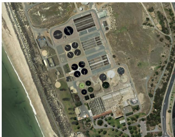
Image 7 Glenelg WWTP