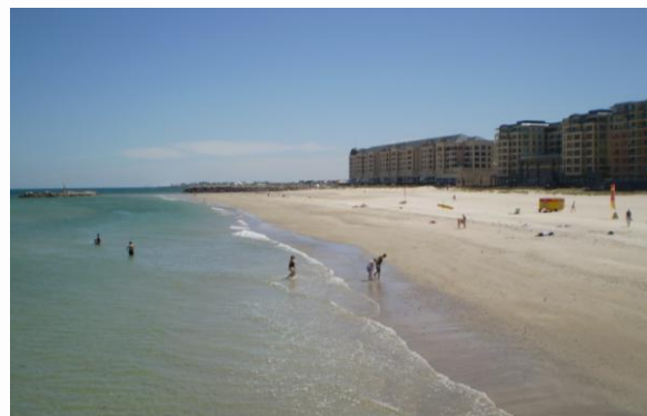
Image 2 Glenelg foreshore 2009