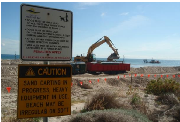
Image 9 Sand carting at Glenelg beach

The main water quality problems for Adelaide's coastal waters relate to loss of seagrass and the degradation of sub-tidal reefs. These seagrass and reef ecosystems are sensitive to increases in nutrients and sediments in the water. A loss of these habitats will result in lower marine biodiversity, reduced productivity and smaller fish populations. Loss of seagrass also means less protection for our beaches from wave action and more mobile sediments. Replenishing these sediments requires expensive and often disruptive intervention by coastal managers (eg sand carting and dumping).