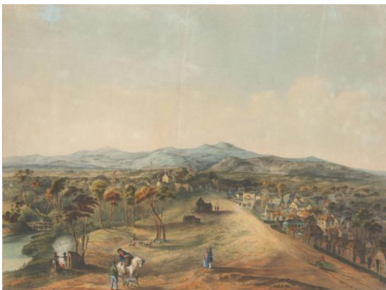
Image 4 Adelaide, South Australia, North Terrace 1841

With increasing urban development over the Adelaide plains since European settlement there has been a related increase in sealed surfaces, such as roads, pavements and roofs (Image 4 and 5). These surfaces prevent rainfall from soaking into the ground, resulting in greater volumes of stormwater being sent down drains and into the marine environment. Stormwater is often high in organic waste such as animal faeces, green waste (lawn clippings and leaves) and nutrients. Stormwater also transports industrial runoff as well as rubber, oil and heavy metals from our roads and motor vehicles into our watercourses and the marine environment.