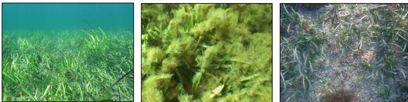
From left to right: Seagrass in good condition, epiphytes on seagrass, degraded seagrass.