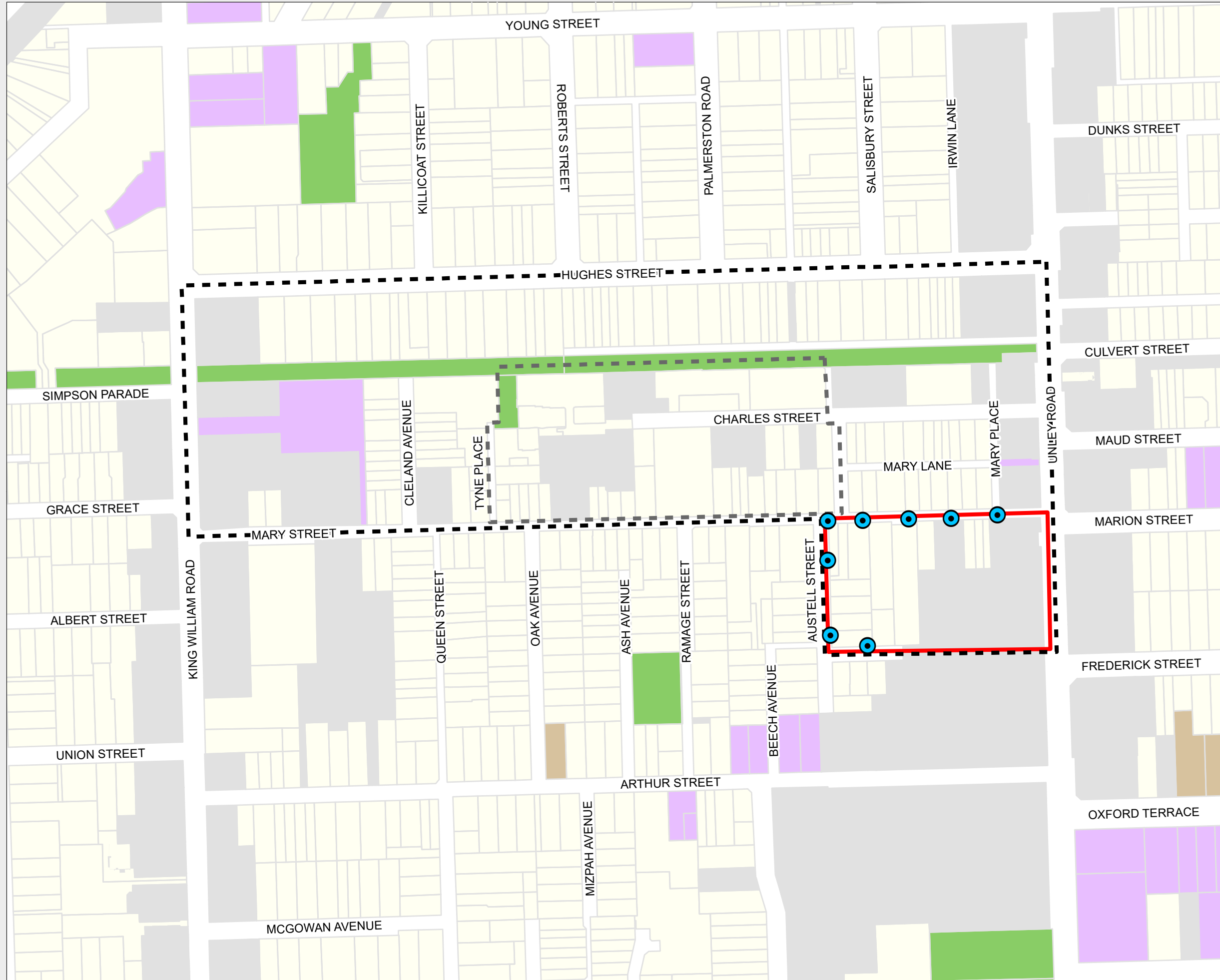
Figure 1 - Unley Stage 3 Assessment