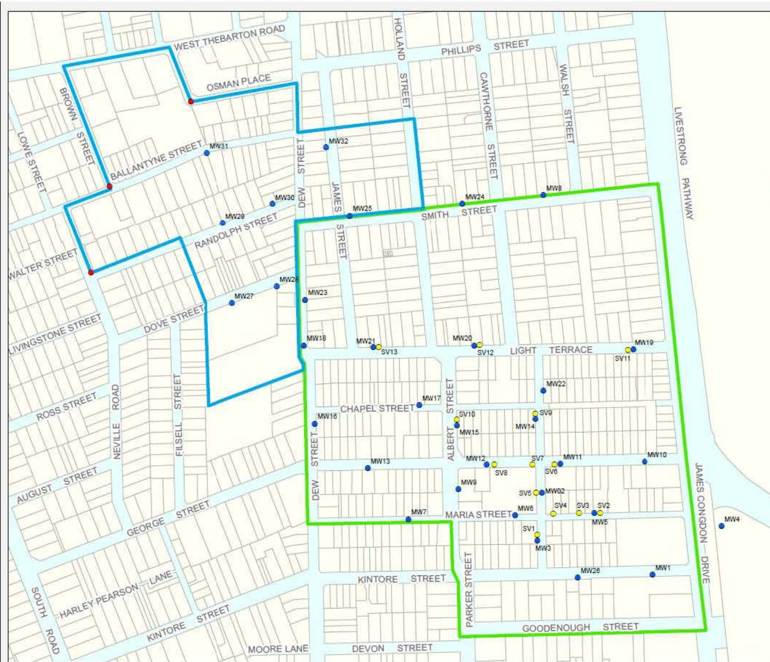
Figure 1: Newly proposed groundwater monitoring well locations and existing Groundwater and Soil Vapor Investigation Locations - Thebarton Stage 2 Environmental Assessment.