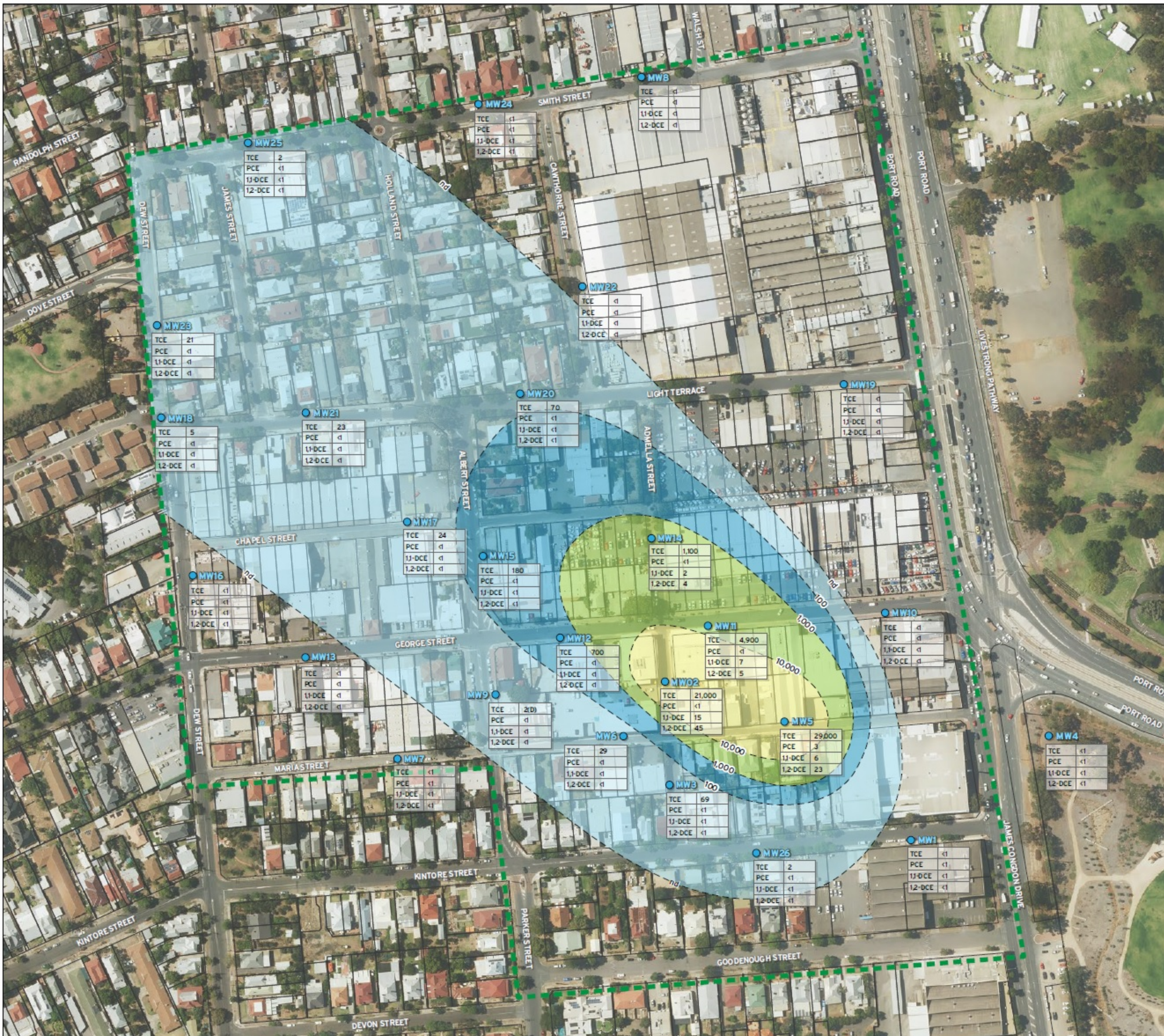
FIGURE 5: GROUNDWATER CONCENTRATION PLAN

LEGEND ● GROUNDWATER MONITORING WELL -100- INFERRED TCE GROUNDWATER CONCENTRATION CONTOURS --- EPA ASSESSMENT AREA □ CADASTRE TCE CONCENTRATIONS (µg/L) >nd to <100 100 to <1,000 1,000 to <10,000 10,000 to 29,000 nd = non-detect (<1) Notes: This is one interpretation only. Other interpretations possible. All concentrations are in µg/L 1,2-DCE includes cis and trans D = Duplicate result