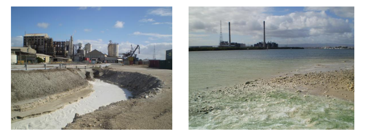
Image 8 Penrice Soda Holdings works (left) and discharges to Port River (right)

Penrice Soda Holdings was established in the late 1930s and uses Solvay processes to produce soda ash for products ranging from glass containers to washing powder. Sodium bicarbonate is also produced for use in applications as diverse as animal feed, food and pharmaceuticals. The processes used to make these products produce high loads of sediment and ammonia which have been previously discharged to the Port River. In recent years Penrice Soda Holdings has improved plant management processes and made use of a sediment settling pond which has led to the recovery of large amounts of ammonia and sediment resulting on significant reductions to the volume discharges to the Port River. Refer to Information Sheet No. 5 Inputs to Coastal Waters (2009) for more detailed information.