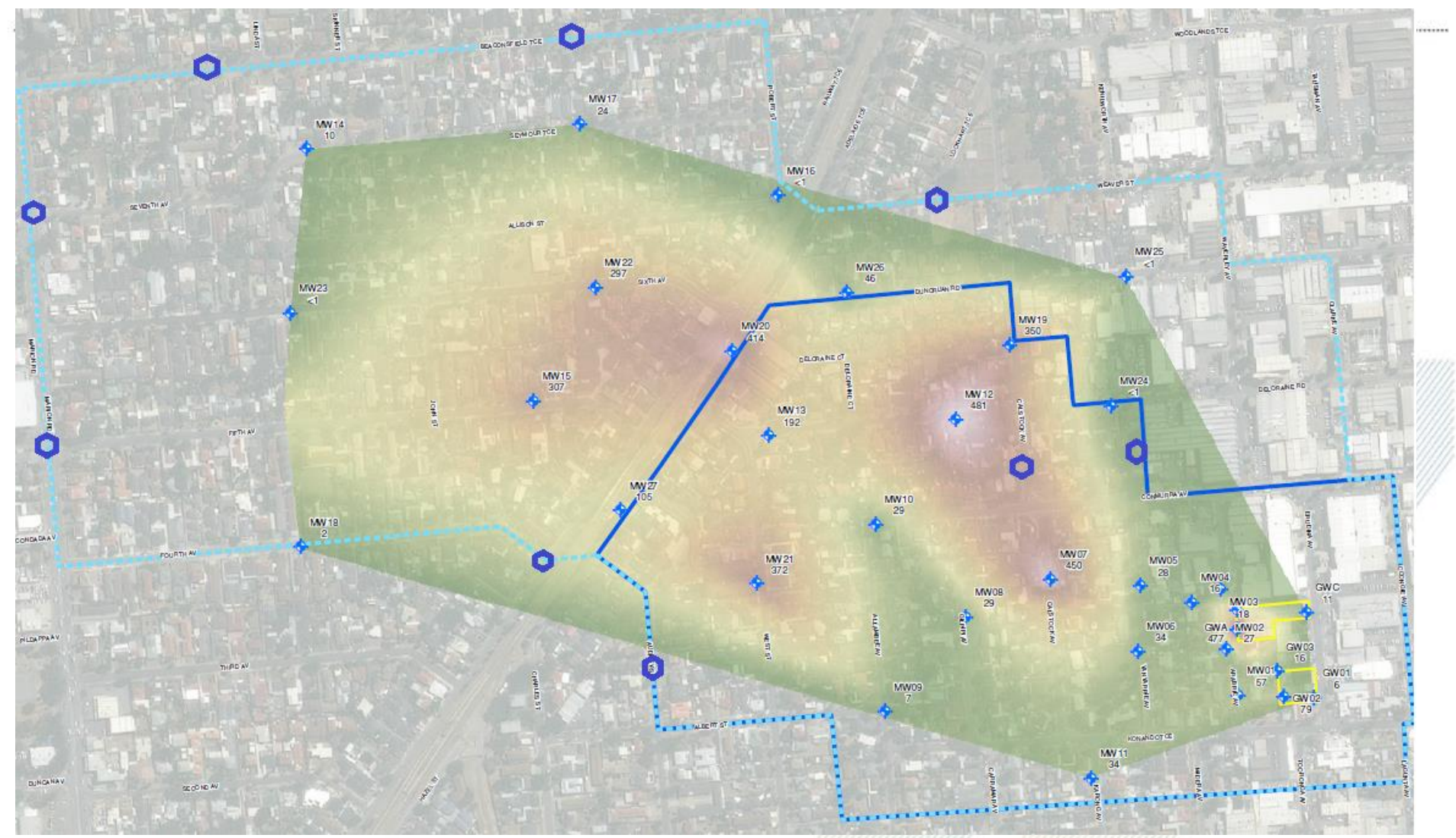
South Australia's Environment Protection Authority