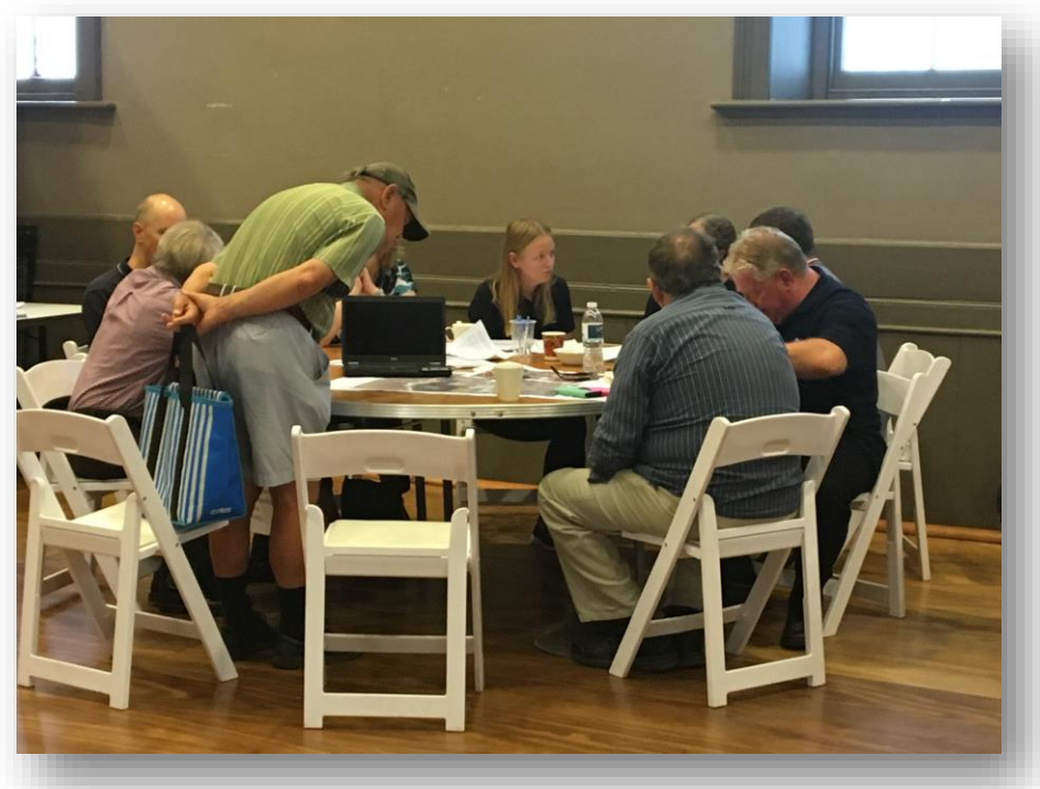
6/2/2017 EPA staff talk to interested members of the community