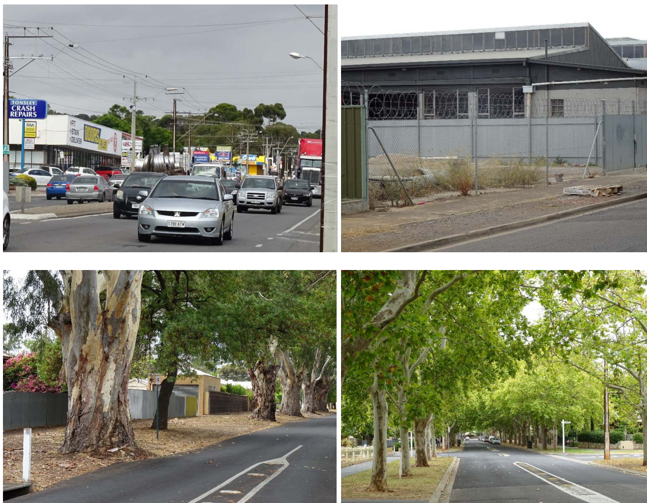
Figure 3 Catchment characteristics: busy roads, industrial areas, quiet suburban streets and types of leaf litter