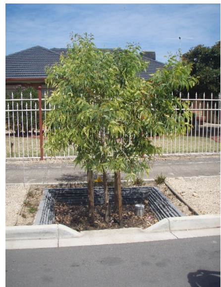
Tree pit bio-filtration system, Beechway Ave, Brooklyn Park

Acknowledgements: We are grateful for the valuable input provided by individuals from the following groups to develop this guide: City of Adelaide, City of Charles Sturt, City of Onkaparinga, City of Unley, City of West Torrens, Coast Protection Board, Department of Environment, Water and Natural Resources, Department for Planning, Transport and Infrastructure, Natural Resources Adelaide and Mount Lofty Ranges, SA Water, Stormwater Management Authority, University of South Australia and Water Sensitive SA.