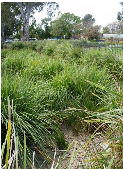
Established bio-filtration rain garden beds at Linde Reserve, Stepney

Rain Garden 500 is a Catchment to Coast project from which local governments, community groups, schools, sports clubs, churches and groups of motivated individuals can apply for funding to build a rain garden in the Adelaide Region. This guide provides information about how you can apply for this funding for the development of bio-filtration rain gardens. Rain gardens help improve the quality of stormwater from our urban environments before it travels to our local creeks and the sea. Improving stormwater quality is part of a strategy to improve seagrass health, benefit our marine environment and keep our beach water cleaner.