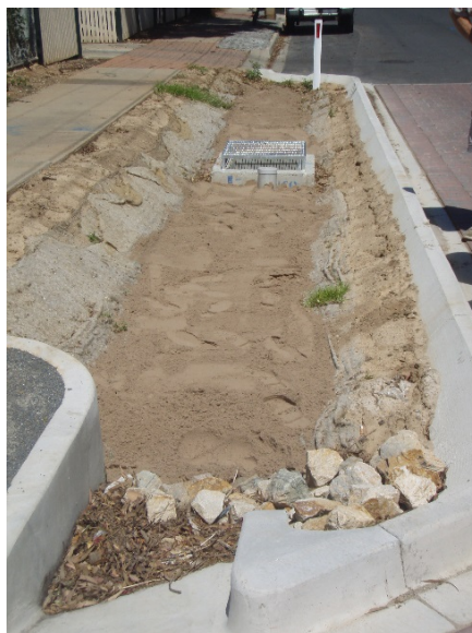
Rain garden bio-filtration system, prior to planting, City Of West Torrens